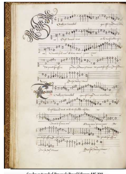
Soubz ce tumbel, Brussels Royal Library MS.228